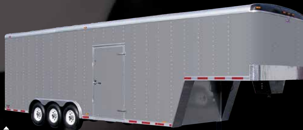
▲ QFF8532TTA4 Qualifier 5th wheel race car trailer shown in pewter.

Cargo Mate builds race car trailers to fit your needs. Whatever your requirements, we can custom design a trailer with the dimensions and features you desire. Cargo Mate offers numerous cabinet and workbench styles and configurations along with a variety of accessories, flooring materials, and color schemes to satisfy the most demanding car owner.