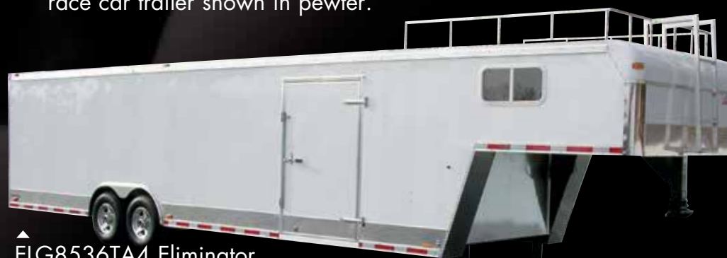
▲ ELG8536TA4 Eliminator gooseneck race car trailer with walk on roof shown in white.