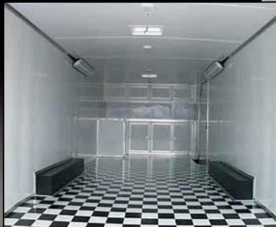
▲ The interior of the 50 ft. car hauler trailer features wheel well cabinets, storage area, workbenches, lights, and overhead crane.

The interior shows workbenches with white storage cabinets and black and white vinyl floor. ▼