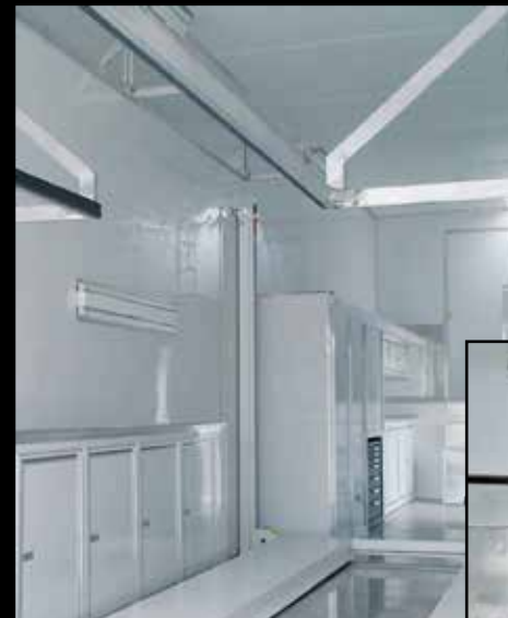
▲ Workbench and storage cabinets are shown with the stacker system installed. 12 volt and 110 volt lighting is available.