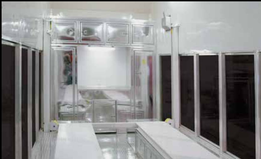
▲ Forward interior view of custom cabinets and workbench in a unit with a stacker lift system installed.

The interior shows workbenches with white storage cabinets and black and white vinyl floor. ▼