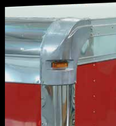
Cast corners are standard on all Eliminator models.