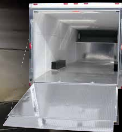
Interior of gooseneck trailer featuring ATP aluminum tread plate and upper bunk area.